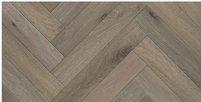
Image shows Rustic option.

Should you require the information on any other details please contact the sales team on 020 8501 6730 or info@wfa.uk.net